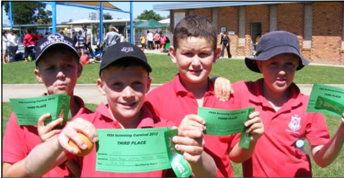
HPS District Carnival Relay team