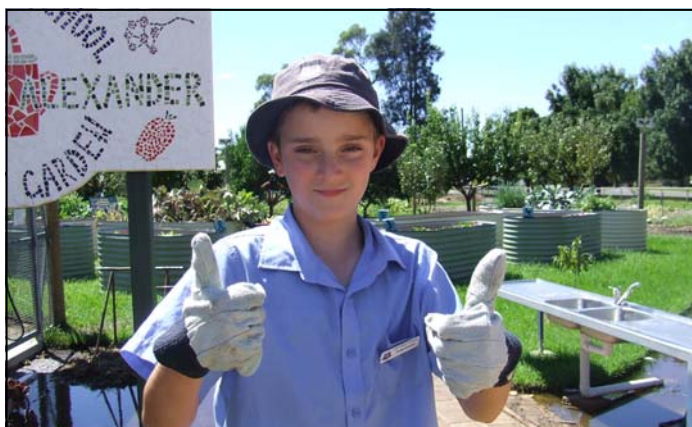
Garden lessons have begun and kids are enjoying the outdoors