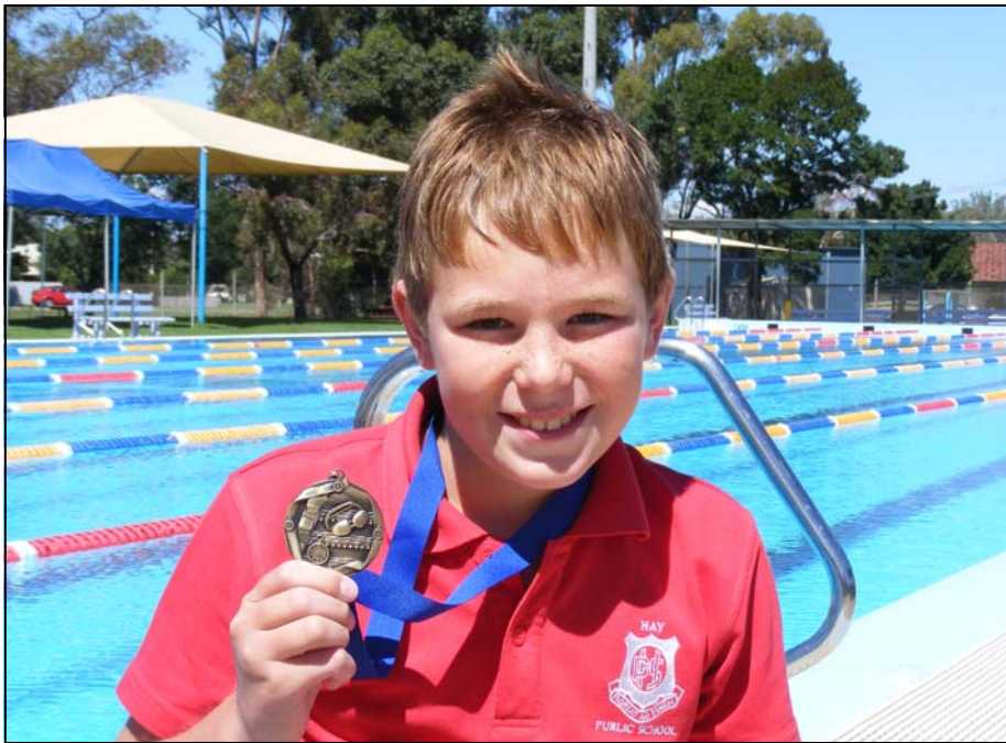
Monte is our champion