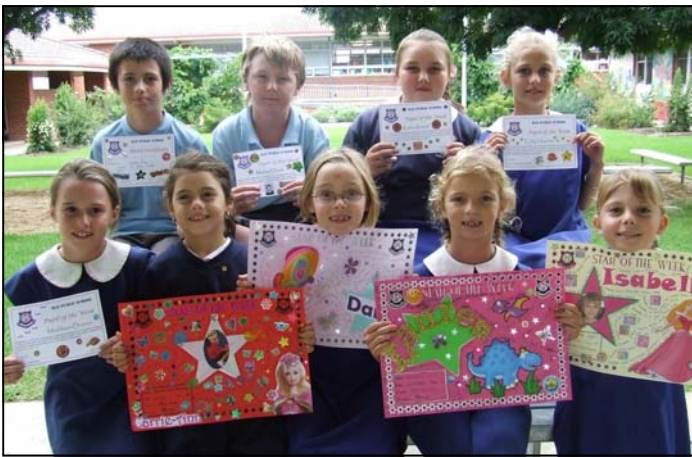
Pupil and Stars of the Week