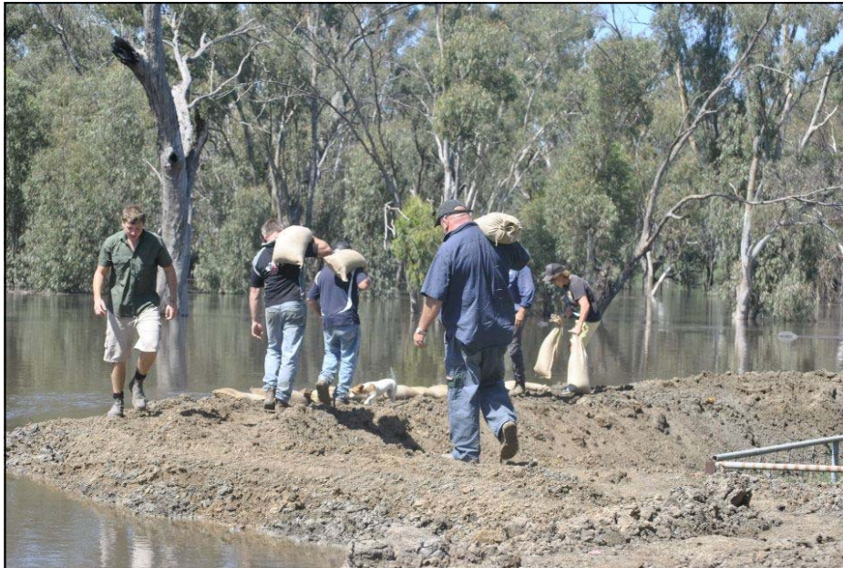
Wonderful volunteers working at 'Riverbrae'