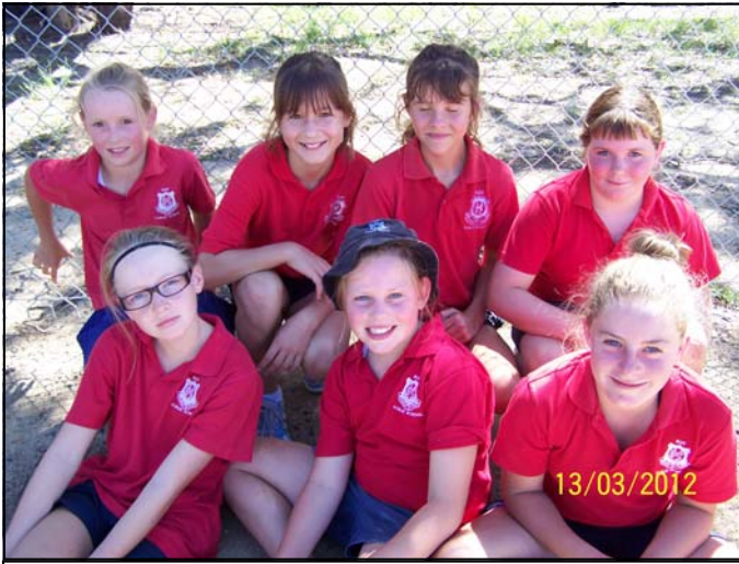
HPS PSSA netball team