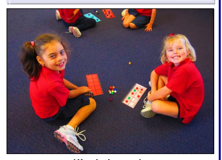
IK enjoying maths