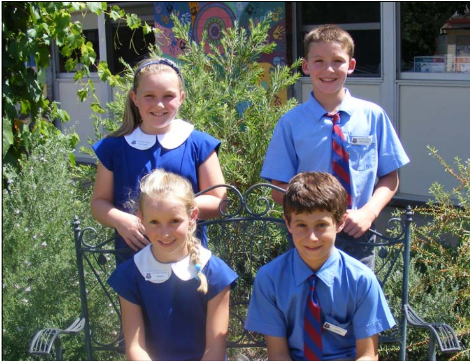
2012 School Leaders