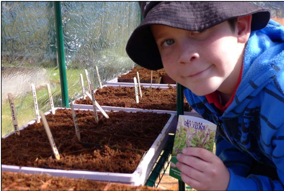
Planting seeds for next year's crop