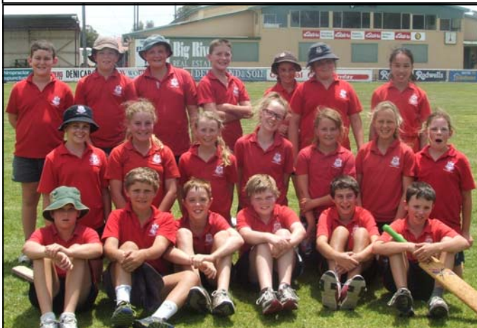
Super 8's Years 5/6