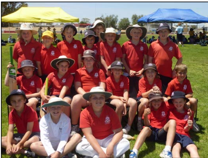
Super 8's Years 3/4