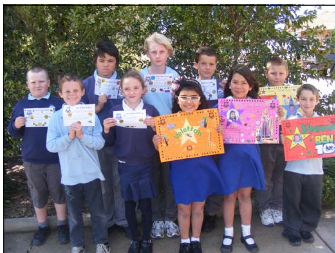
Pupil and Stars of the Week