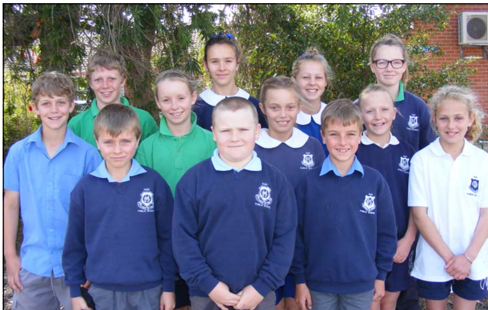
NSWPSA State Representatives